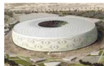
AL THUMAMA STADIUM: supply of pumps.