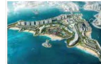
Qetaifan Island: Design & Qetaifan island north development package 3 water pack, lusail qatar. Grespania.