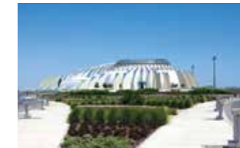
Amiri Building & VIP Lounges at Doha International: Supply and installation of Daikin AC units.