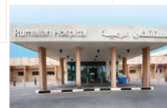
Rumaila Hospital: Supply, Installation, testing & commissioning of Honeywell Trend BMS.