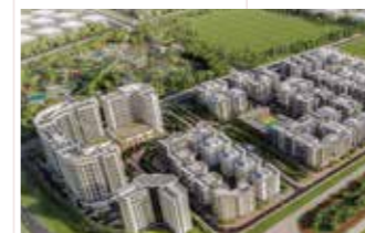
ERKYAH Building at Lusail: Supply of Sanitary ware and accessories.