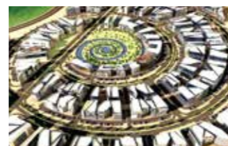
ECQ Building at Energy City Lusail: Supply of Kitchen cabinets, Ceramic and Porcelain tiles.