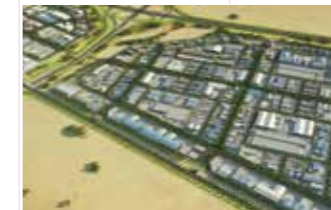
Al Wakra Logistics Park: Design & build of site works and infrastructure for Al Wakra logistics park phase 1.