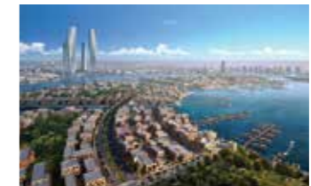
Lusail City: CP07-F Testing commissioning and miscellaneous works for potable water network Lusail city.