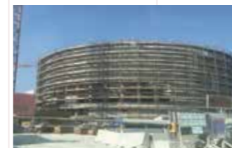
Ess Doha Pumping Station: Supply, testing & commissioning of Honey.