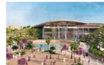
Doha Expo 2023: Construction and Fit Out of building for Doha Expo 2023.