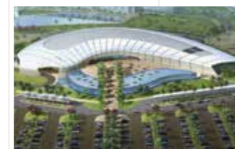
Multipurpose Admin Building at RAS LAFFAN (Qatar Petroleum): Supply and Installation of kitchen cabinets.