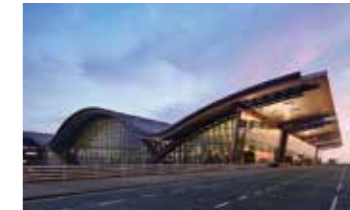
Hamad International Airport: Supply of Epdm & accessories.