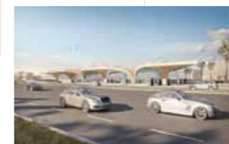
Qatar Integrated Railway Project (QIRP): supply of Xylem flygt pumps.