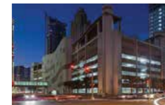
Multistory Parking Lot GP at Westbay: Supply, installation, testing & commissioning of Honeywell Trend BMS.