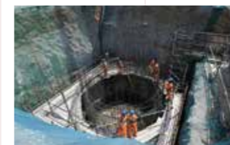
Various sewage pumping stations (Main PS-14/1): Refurbishment and upgrading works, Xylem Flygt.