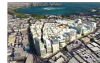
Musheireb Storm & Foul Water Pumping Station.