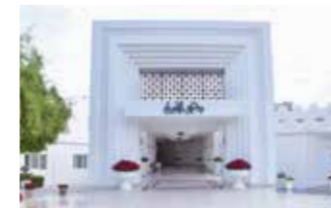
Shura Council Building: Supply of Daikin DX & VRV systems.