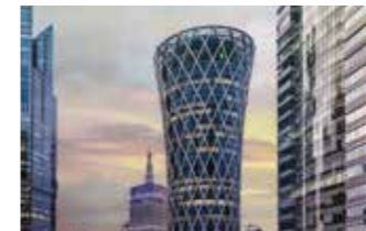
The Dawn Plaza Torando Tower: Supply of Epdm & accessories.