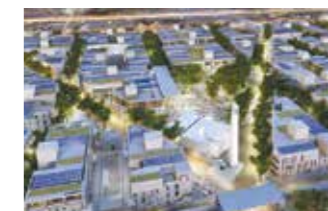
Sidra Village at Qatar Foundation: Supply and Installation of kitchen cabinets.