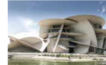
National museum of Qatar: Supply and installation of VRV systems.