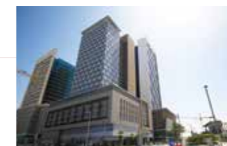
Lusail Marina 50: Upgradation of BMS System (Honeywell-Trend).