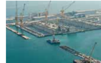
Nakilat Ship Repair Yard: Supply and installation of VRV systems.