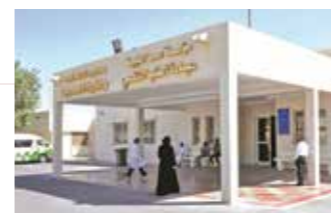
Psychiatric Hospital: Supply, testing & commissioning of Honeywell Trend BMS.