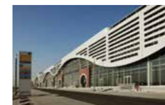
Barwa Commercial Avenue: Supply & Installation of Kitchen cabinets, Ceramic and Porcelain tiles.