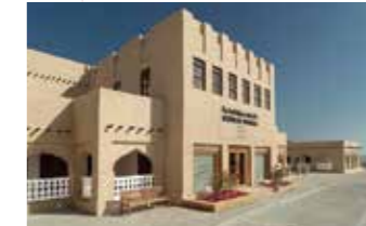
Tow hotels at Al wakra: Supply and installation of VRV systems.