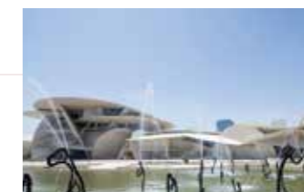
National Museum of Qatar South Carpark: Kiosks and landscaping package, Bradford-White.