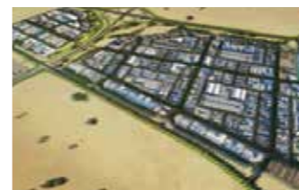
Al Wakra logistics park phase-1 (WLP -A&B): Design & build of site works and infrastructure for, Xylem Flygt.