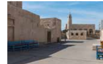
Al Wakrah Heritage Village: Supply and installation of VRV systems.