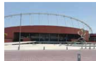
Aspire Zone Project: Supply, testing & commissioning of Honeywell Trend BMS.