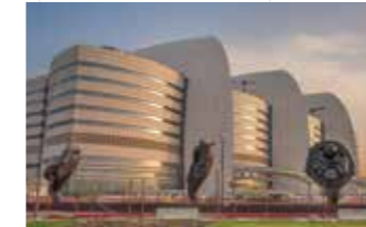
Sidra medical research: Supply and installation of VRV systems.