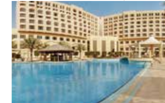
Intercontinental hotels at al wakra: Supply and installation of VRV systems.