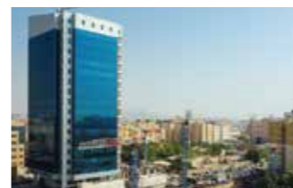
Al Jassim Tower: Install 58 Kitchen with solid surface and T-TECH appliances & Bellacasa wall and floor tiles.