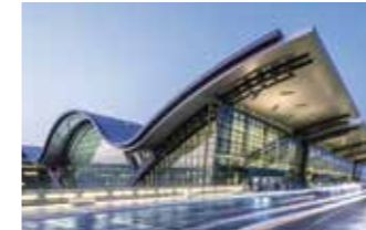
Hamad International Airport (HIA): Supply of Trox Swirl Diffuser.